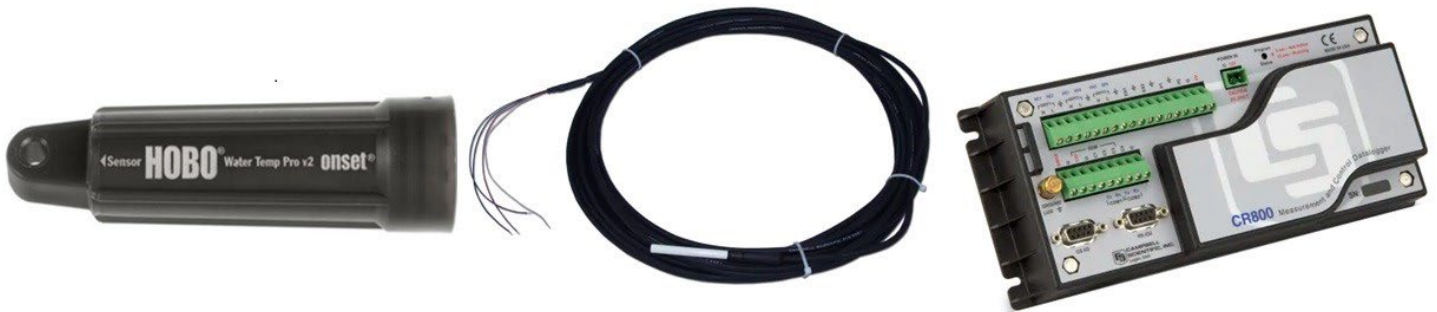
Figure 3 - Temperature monitoring equipment.

Data at CR-WGD, CR-HSU, and CR-WFU are collected and transmitted in real-time using Campbell Scientific Model 109 Temperature Probes connected to Campbell dataloggers. The Campbell datalogger records temperature data from the 109 Temperature Probe at one-minute intervals and averages the one-minute data every 15 minutes, 24 hours a day, year-round. These data are collected and transmitted in real-time via telemetry to Northern Water's website. The real-time data are provisional. These data are validated in Northern Water's WISKI database during the winter and are available upon request.